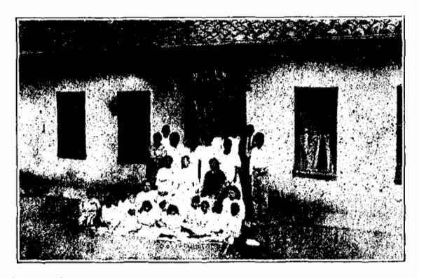
NEW MISSION AND HOME OF OUR PENTECOSTAL WORKERS IN CENTRAL AMERICA

"Just about a year ago while giving out tracts and Scripture portions we felt led to put one under a door where the people were out. It happened to be the home of a hardworking woman. She came home that night, found the book and became so enraptured with its contents that she read, wept and prayed all night. Her next door neighbor was horrified when she saw the book and told her to burn it at once for the Padre (priest) said that those who read it would be lost forever. But during the night the woman had had a taste of God's Word and said, 'No, I will not burn it.' About four months ago she came to us. We wondered how she came, but it was through that Scripture portion put under her door. She is now seeking the Lord with all her heart. When she first got the light she was living with a married man (as is the custom here) but has given him up. He is persecuting her terribly but she is going on with the Lord and is seeking all that He has for her. Thus the Lord is working, here one and there one. We could tell of others but time will not permit."